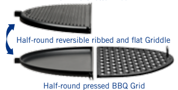
Half-round reversible ribbed and flat Griddle