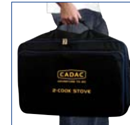
The 2-Cook Deluxe & 2-Cook Supreme come with a carry/storage bag.