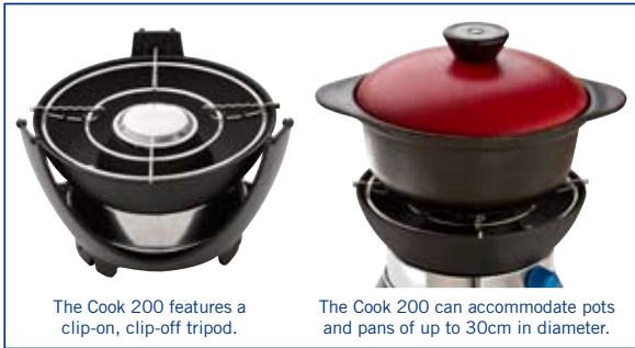
The Cook 200 features a clip-on, clip-off tripod.