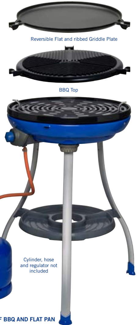
Cylinder, hose and regulator not included