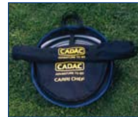
Individual carry bags