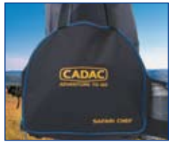
The Safari Chef comes with a carry bag and weighs only 4kg