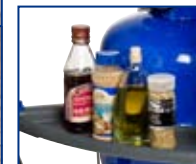
Convenient condiment tray