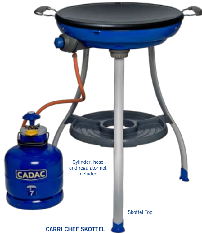
Cylinder, hose and regulator not included