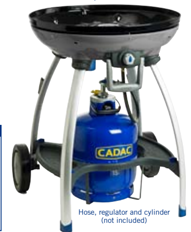
Hose, regulator and cylinder (not included)