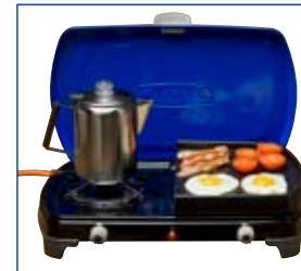
The 2-Cook Deluxe with pot stand and flat griddle combination

2-Cook Supreme connected with hose, regulator and cylinder (not included)