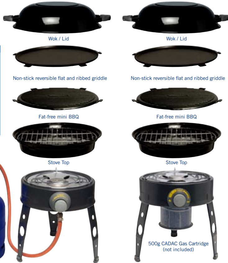
Wok / Lid