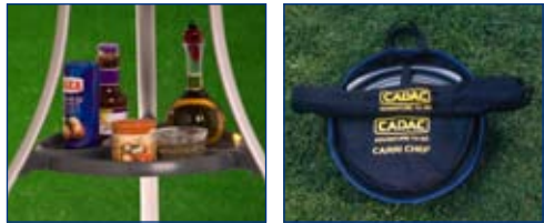
Convenient Condiment Tray