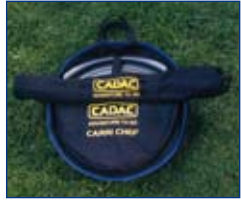
Individual carry bags