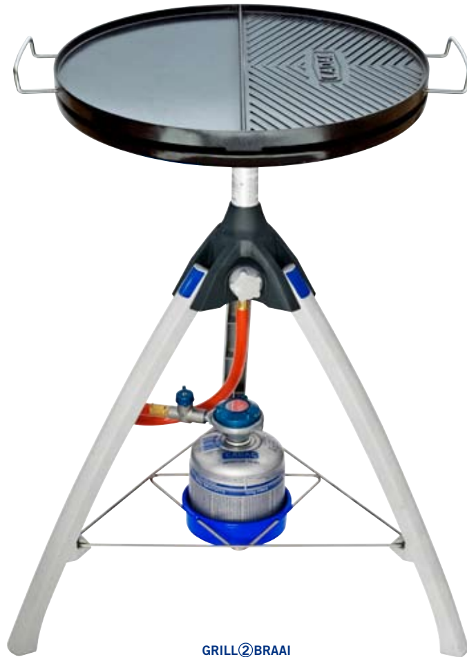
GRILL 2 BRAAI

The Grill 2 Braai can work off EITHER a 500g CADAC threaded gas cartridge, the Power Pak 1000 or a refillable gas cylinder (not included)