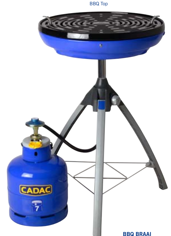
Cylinder, hose and regulator not included