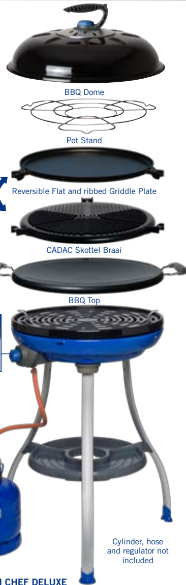
Push-button Piezo Ignition