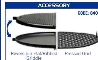
Reversible Flat/Ribbed Griddle