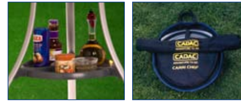
Convenient Condiment Tray