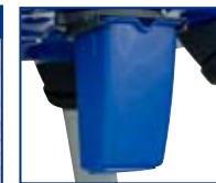
Removable drip cup