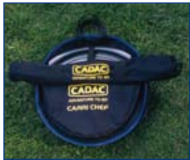
Individual carry bags