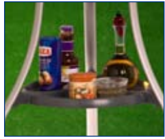
Convenient Condiment Tray