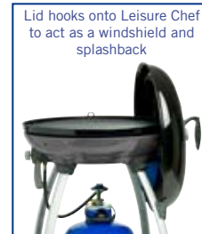
Lid hooks onto Leisure Chef to act as a windshield and splashback