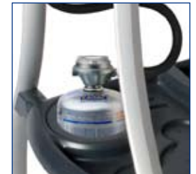
Works off a 500g threaded gas cartridge connected to a CADAC EN417 hose and regulator assembly (not included)