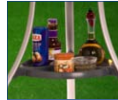
Convenient Condiment Tray