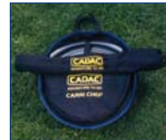
Individual carry bags